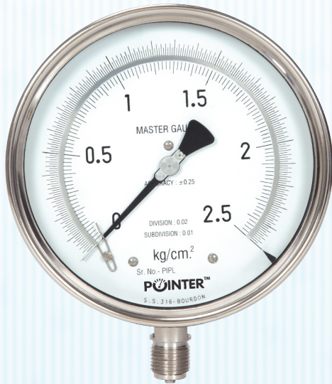
150mm Precision Test Gauge

“POINTER” Precision Test Pressure Gauges are extremely sensitive and highly accurate with adjustable knife edge pointer and mirror bends on the dial to assure precise readings and to eliminate parallax error. Also suitable for gaseous and liquid media, particularly for testing and calibration.